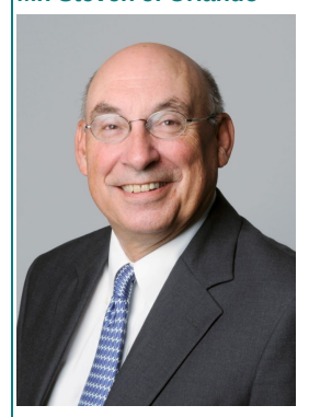
Founder, Orlando Company